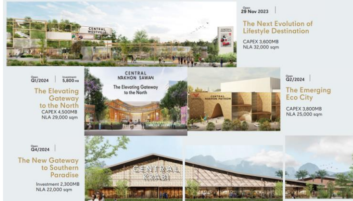
Figure 3: CPN's new retail malls to be launched in 2H23-2024