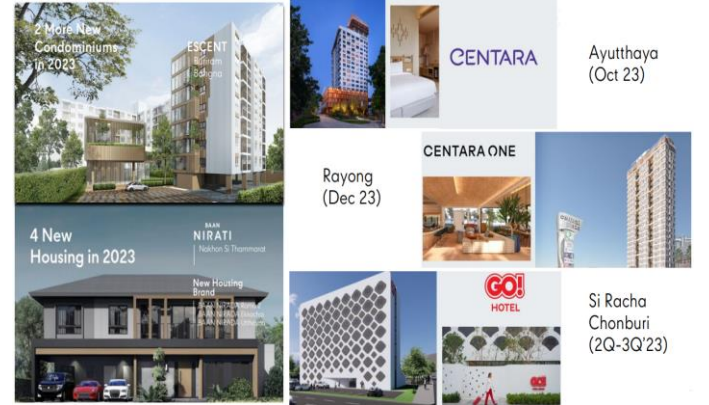
Figure 4: CPN's non-retail projects to be launched in 2H23